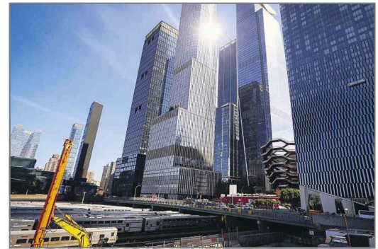
The White House has “terminated” funding for $16 billion Gateway.