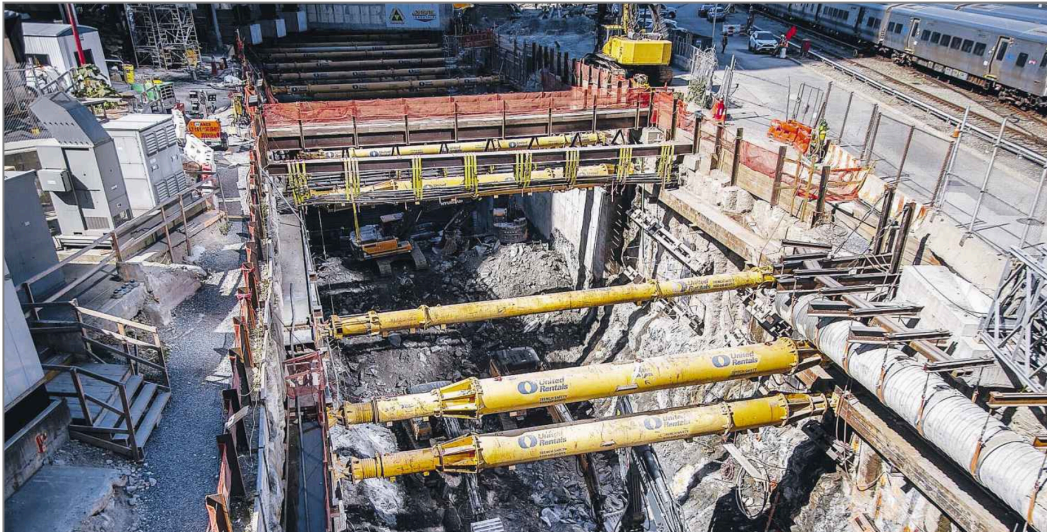
The Gateway project is building a new Hudson River crossing after the original, century-old tunnel was damaged during Superstorm Sandy.

to-expire health care subsidies they contend will raise insurance premiums for millions of Americans if not renewed.