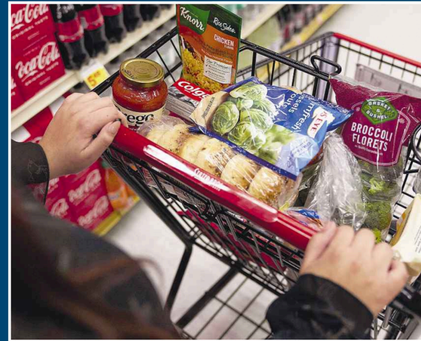
More than 3 million New York State residents rely on the program, officials say.

SNAP payments will be delayed next month if stoppage drags on, officials say, affecting 160,000 Liers