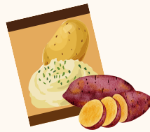
Mashed Potatoes or Yams 1 box or can