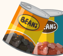
Beans 2 cans