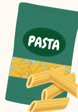
Pasta 1 box