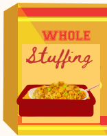
Stuffing 1 box