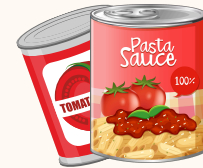
Tomato Sauce or Pasta Sauce 1 can