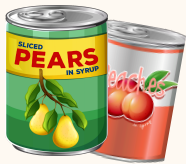
Fruit 4 cans

This season, we're asking for items that reflect the meals and traditions our neighbors cherish during the holidays. Each donation helps create a meaningful celebration while allowing families facing food insecurity to put limited resources toward other essentials. Together, we can make the season brighter for all.