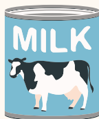
Shelf Stable Milk 1 can